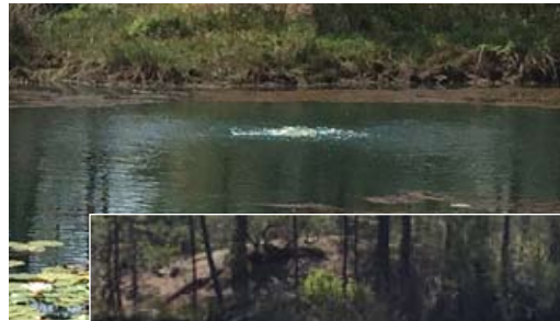
The first 3 bubblers hard at work in Lost Mine Lake