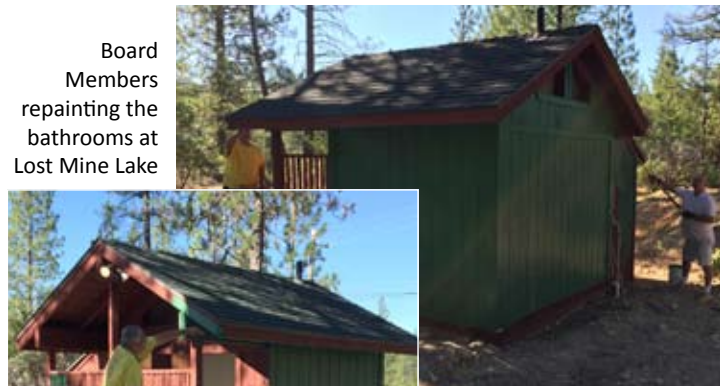
Board Members repainting the bathrooms at Lost Mine Lake