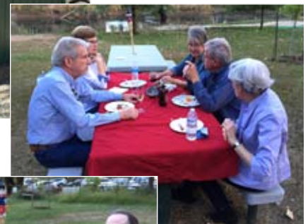
Cascade Shores residents enjoying one of the summer BBQs at Lost Mine Lake hosted by the Homeowners Association