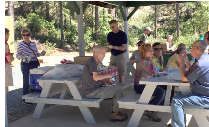
Residents enjoying the Ice Cream Social