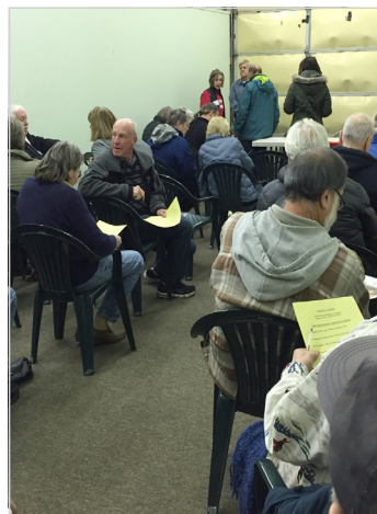
Residents attend the Fire Safety and Evacuation meeting in January.